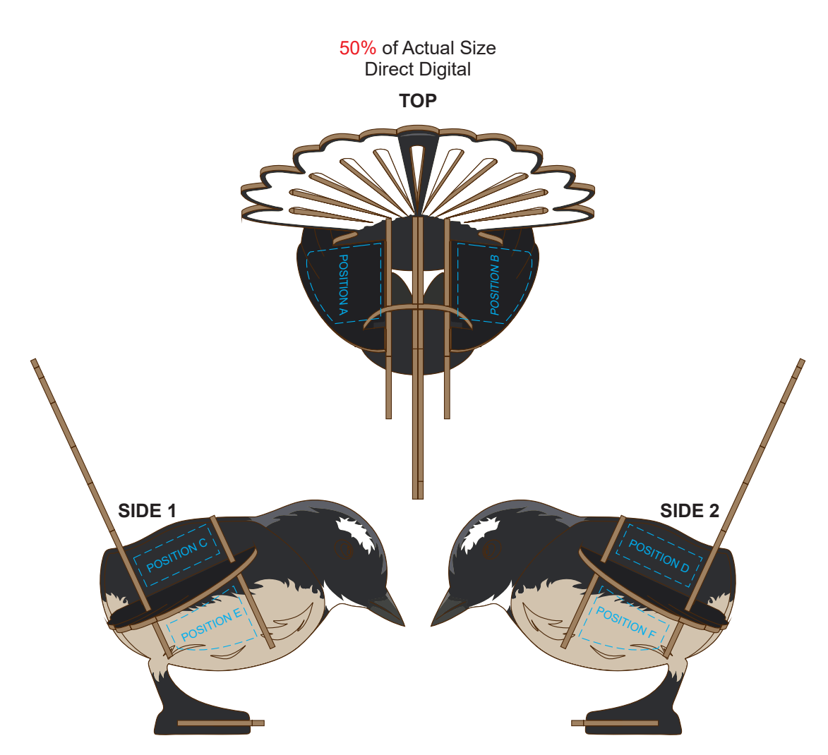
Up to a 2mm tolerance is expected for alignment of the printed artwork against the engraved lines. Slight inconsistencies are to be considered acceptable if the artwork is printed over an engraved line. Blue Line = Safe area for Arwork