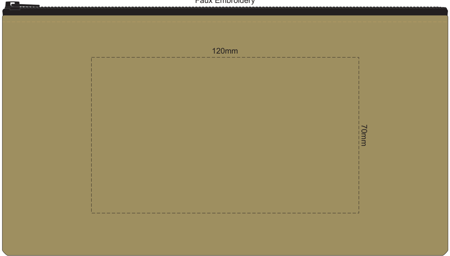
FRONT (Closed zipper)

100% of Actual Size Screen Print (one colour) Colourflex Transfer Faux Embroidery