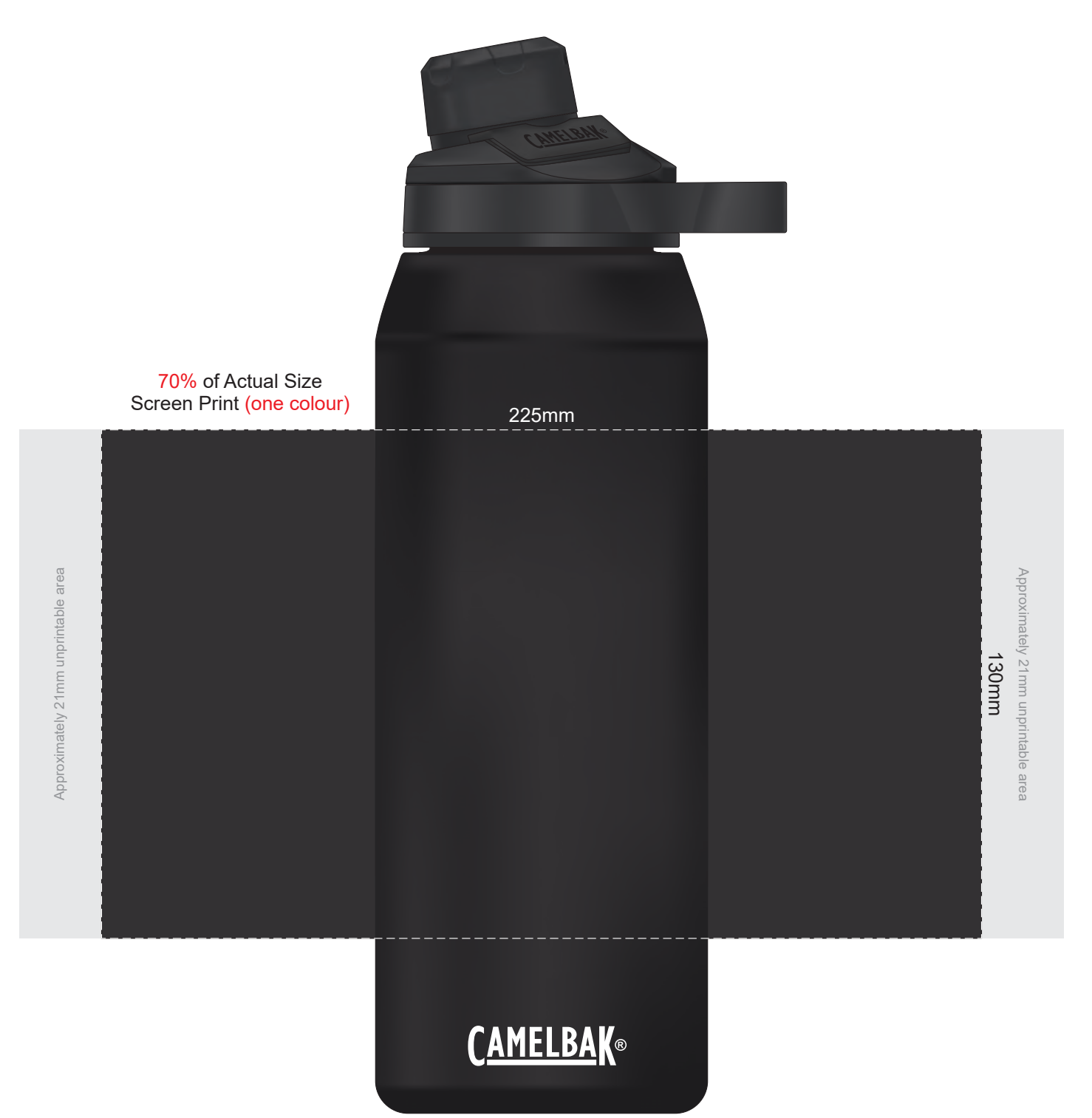
A 2-3mm tolerance is expected for alignment of the printed artwork and the CamelBak logo.