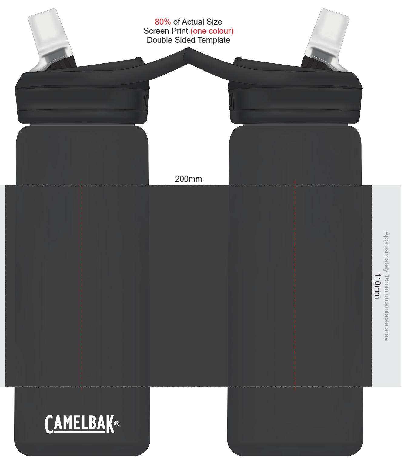
A 2-3mm tolerance is expected for alignment of the printed artwork and the CamelBak logo.