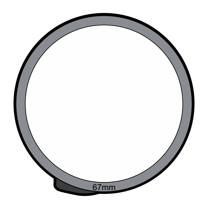
Resin Coated Finish

Actual Size: 100% when viewed on A4 paper